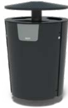
DUNC 3 WASTE FLOWS 60L